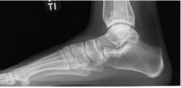
Fig. 1. Preoperative ankle radiographs showing the necrosis of the partial talar dome allograft, with lucency between the graft and host talus.