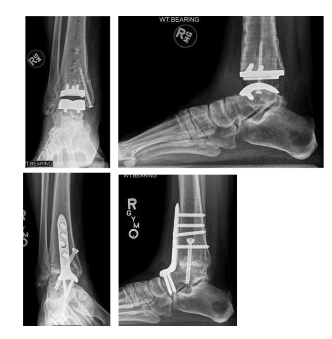
Fig. 3. Postoperative ankle radiographs after ankle arthrodesis with calcaneal autograft and allograft supplementation. Postoperative ankle radiographs after conversion of ankle arthrodesis to total ankle replacement as a result of painful adjacent joint arthritis, after revascularization of the talus.

future takedown of ankle fusion with conversion to total ankle arthroplasty if the patient developed adjacent joint osteoarthritis (Fig. 3). Approximately 1 year after initial presentation, an ankle arthrodesis